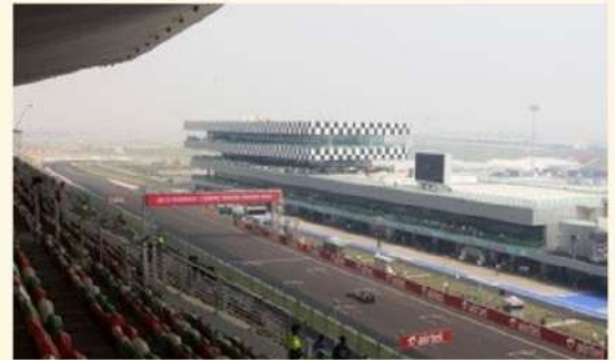
JP F1 Race Track

Jewar Airport, officially Noida International Greenfield Airport, is a proposed international airport to be constructed near the town of Jewar in Gautam Budh Nagar.